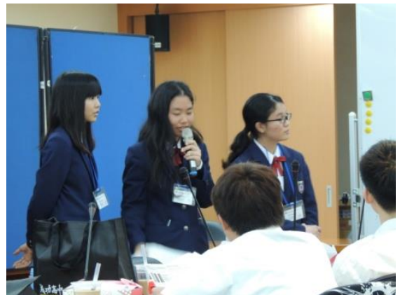
Poster presentation I