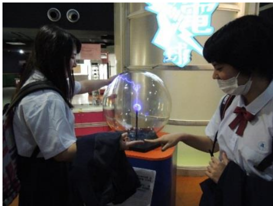
National Taiwan Science Museum

Happy New Year. Let's do our best this year. The SSH Taiwan Science Study Trip was after New Year's, from January 4 th to January 7 th . We visited the Insect Museum, the National Taiwan Science Education Center, National Taiwan University and a tea cultivation and tea museum in New Taipei City. Also, we exchanged poster presentations with local Taiwanese high school students. We completed our posters at the end of the year, translated Japanese into English, and practiced our presentation very hard in English. We worked hard to speak English through the exchange and we could make a good presentation in English. The Taiwanese students have good English abilities. Kyuyo students who participated in this program must have felt the necessity to study harder. They will work hard to study English from now on.