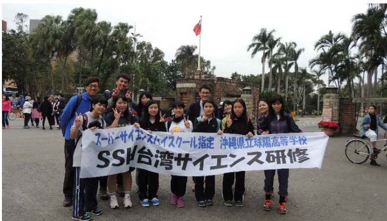
National Taiwan University