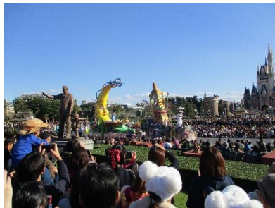
At the Disney Land and Sea