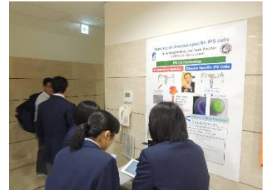
At Meteorological Research Institute.