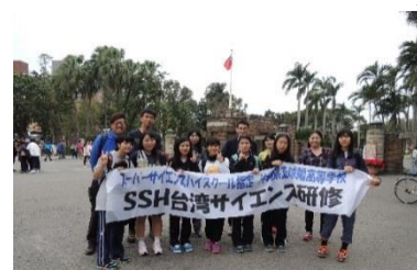
SSH Science Trip to Taiwan