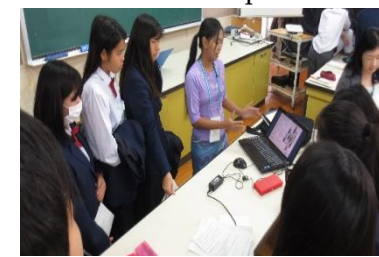
Cooperation Class with JICA Trainees