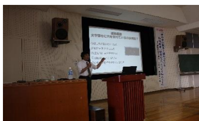
Lecture for Intellectual Property