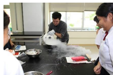
Science English Lab