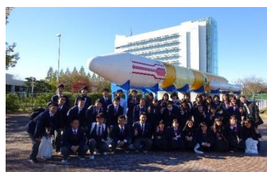
A Study Trip to Tokyo and Tsukuba