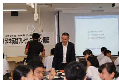
OIST Presentation Lecture