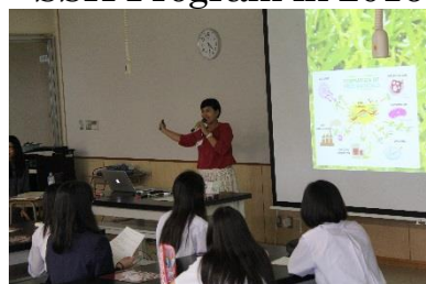
OIST Science Lecture