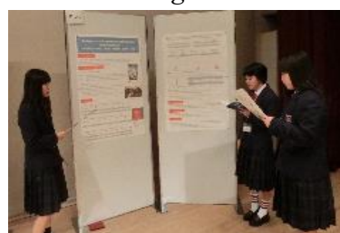
Poster Presentation in Ibaraki