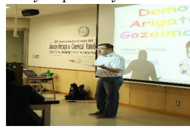
SSH Science Lecture